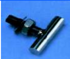
PE114 "T" BAR