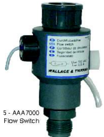
5 - AAA7000 Flow Switch