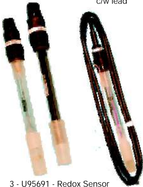
3 - U95691 - Redox Sensor