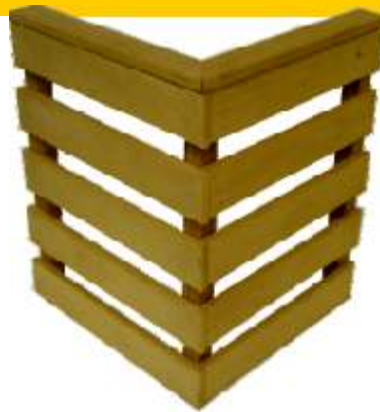
2 Sided Corner Guard

Please Note: An additional packaging & carriage may be applicable, and will be quoted at the time of quote.