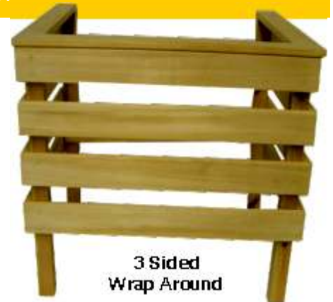
3 Sided Wrap Around

Custom made to fit any space and any heater. Please specify your requirements.